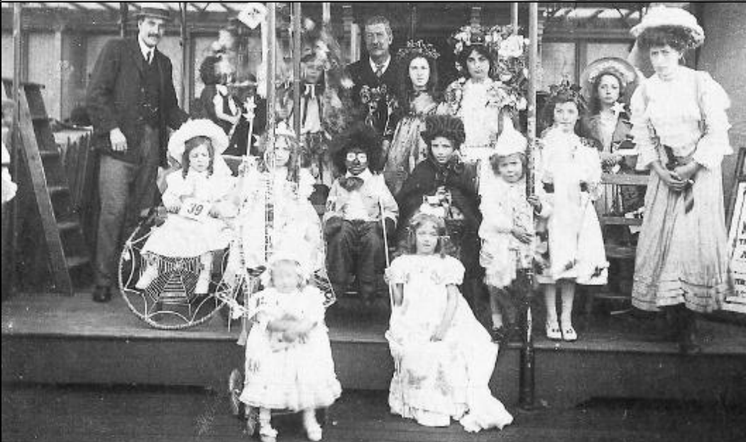
1908 Children's Carnival on Worthing Pier