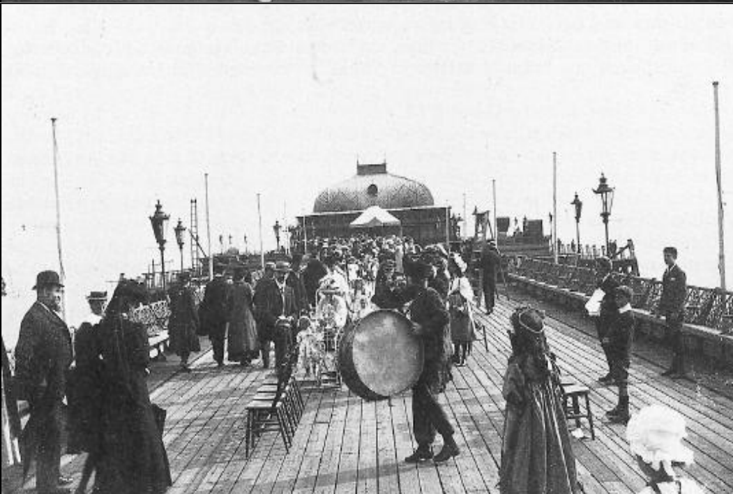
1908 Carnival on Worthing Pier