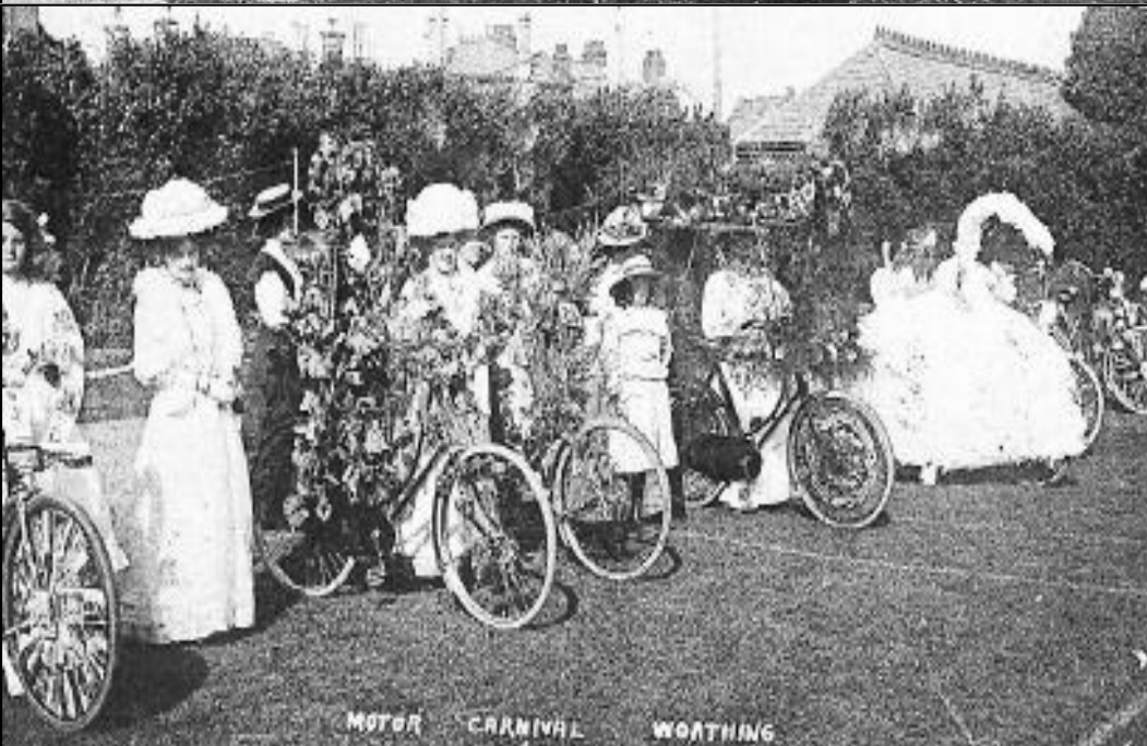
1908 Motor & Cycle Carnival