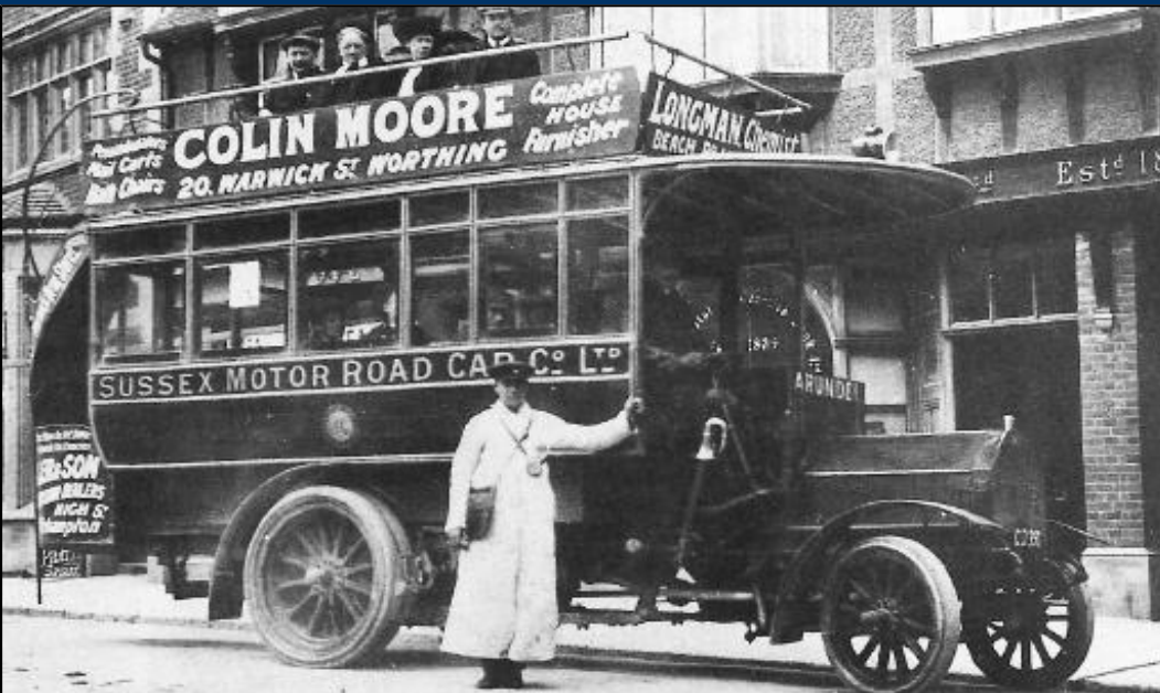
Sussex Motor Road Car Company Bus