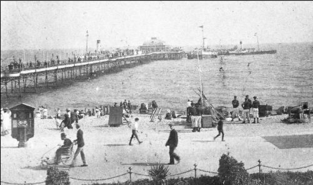
Steamer's at Worthing Pier