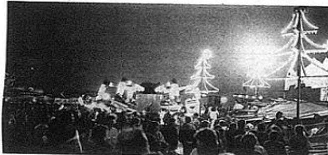
ALL the fun of the fayre – and the energy of pop-mobility – as enjoyed at last year's event