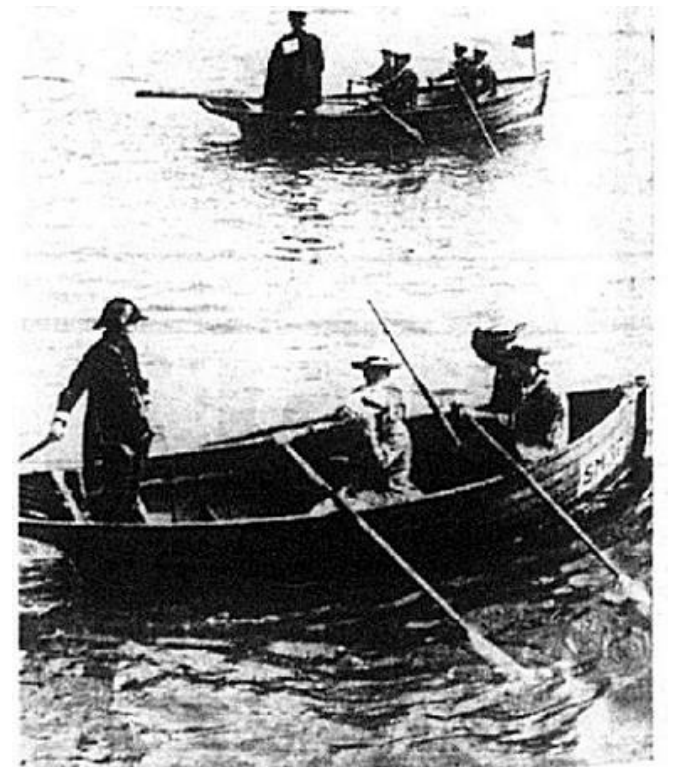
"NELSON AND SAILORS" from West Tarring Working Men's Club won the prize for the best fancy dress in the publican's boat race during Worthing Regatta on Saturday. Behind them is the "Schoolmaster and pupils" entry from the Half Brick Hotel.

For more resources visit: www.worthingpier.org.uk